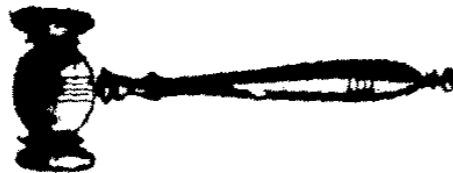
The traveling gavel was last seen at Whitney Lodge #167, Canton.

"HAPPY BIRTHDAY to our MAY BIRTHDAY BRETHREN"